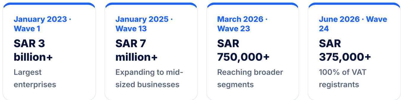
Key Phase 2 e-invoicing waves (revenue threshold and compliance date)

E-invoicing coverage widens until every registered business is included