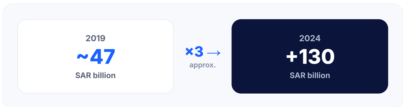
Growth of VAT revenue (SAR billion)

Since VAT was introduced in January 2018 and its rate raised to 15% in July 2020, revenue has roughly tripled. It rose from around SAR 47 billion in 2019 to more than SAR 130 billion in 2024, leading non-oil revenue sources, supporting public-finance stability, and reducing reliance on oil.